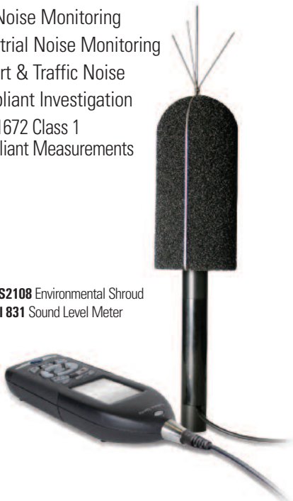
Model EPS2108 Environmental Shroud Model 831 Sound Level Meter

Because field visits to a remote monitor can be expensive and time consuming, the PRM2103 has been designed to require no routine maintenance. It includes a built-in humidity and temperature sensor and can automatically turn on an internal heater when there is a risk of condensation. All this has been accomplished while keeping power usage low (< 2 mA with heater off) so that the PRM2103 is an excellent solution for battery powered applications.