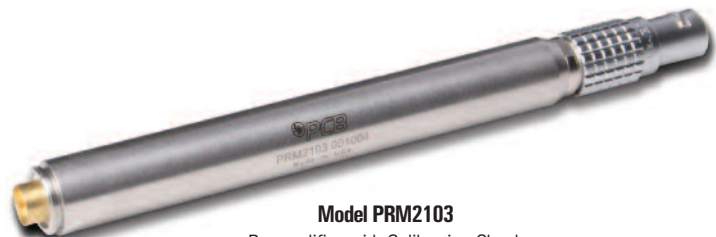
Model PRM2103 Pre-amplifier with Calibration Check